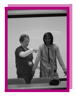
"Everyone said schooling was worth it."