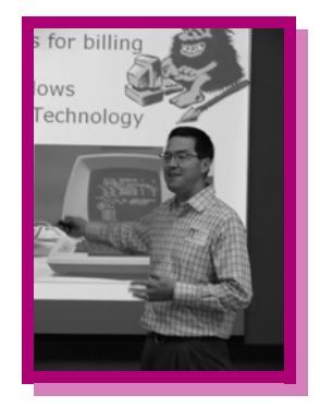
"Personal success stories are always great help to understand it is doable with support."