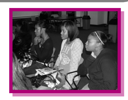
"There was a lot more to some of the jobs than I originally thought."