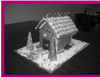
Won "Best Decorated"