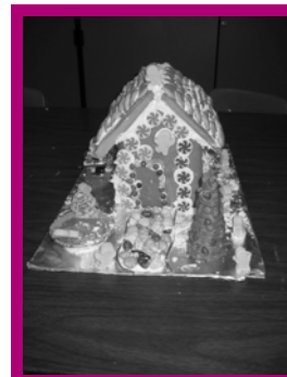
Won "Most Original Design"

Illinois Valley Central High School is a strong advocate for simulated learning. This thriving school readily admits that students learn from more than just traditional methods such as textbooks and notebook paper. In order to meet the ever changing needs of students, IVC offers non-traditional courses, one of which is called Bakeshop .